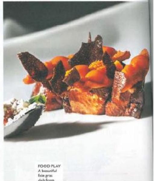
FOOD PLAY A beautiful foie gras dish from DiverXO's David Muñoz