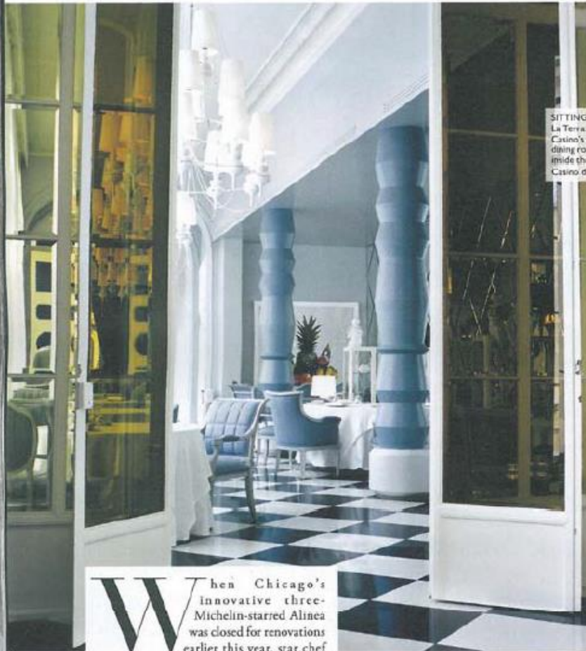
SITTING PRETTY La Terraza del Casino's elegant dining room inside the historic Casino de Madrid