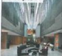
SEEING THE LIGHT The modern lobby of NH Collection Madrid Eurobuilding hotel

located a short walk from Santiago Bernabéu Stadium, home of Real Madrid. Room rates from $166, suite rates from $630, nh-collection.com