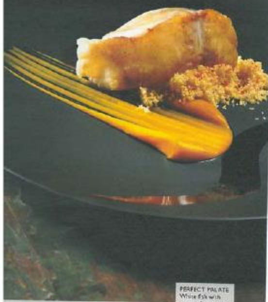
PERFECT PALATE Whole fish with piece of yam and fried-garlic powder from Santceloni