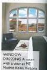
WINDOW DRESSING A room with a view at ME Madrid Reina Victoria

Its setting alone in the iconic Plaza Santa Ana, with a bevy of tapas bars just steps away, would rate this hotel high on any visiting food fan's list. But add in its oh-so-cool vibe from its ground-level restaurant and hip rooms to its stunning rooftop lounge, which recently underwent an extensive renovation, and it's no wonder this hotel's 180 rooms and 12 suites are in constant demand. Room rates from $205, suite rates from $267, meho.com