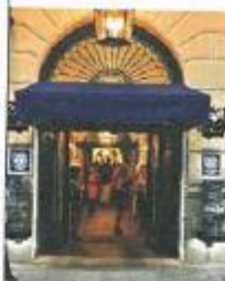
HOTEL SWEET The entrance of Only You Boutique Hotel Madrid